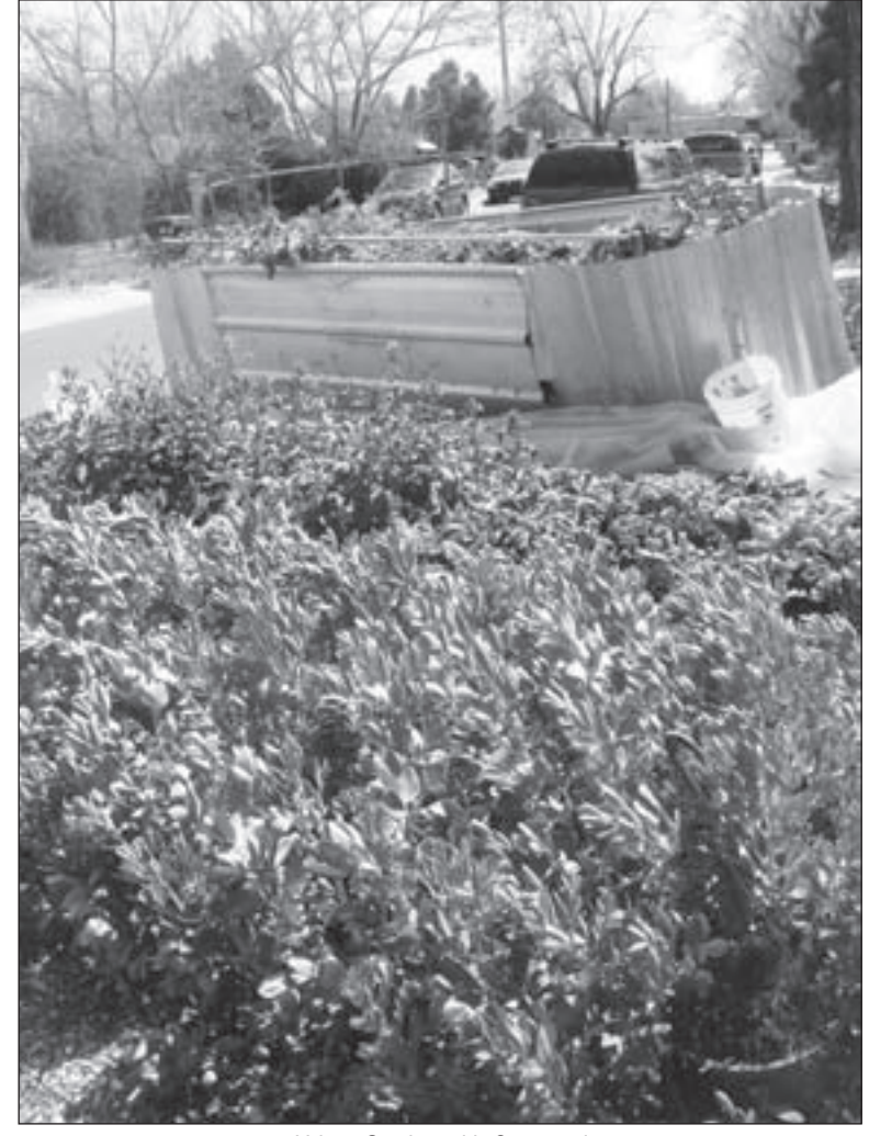
Urban Garden with Composting

It's time for all of us as human beings to step up to the plate, embrace the spirit of change and treat animals humanely and with respect as equal living creatures.